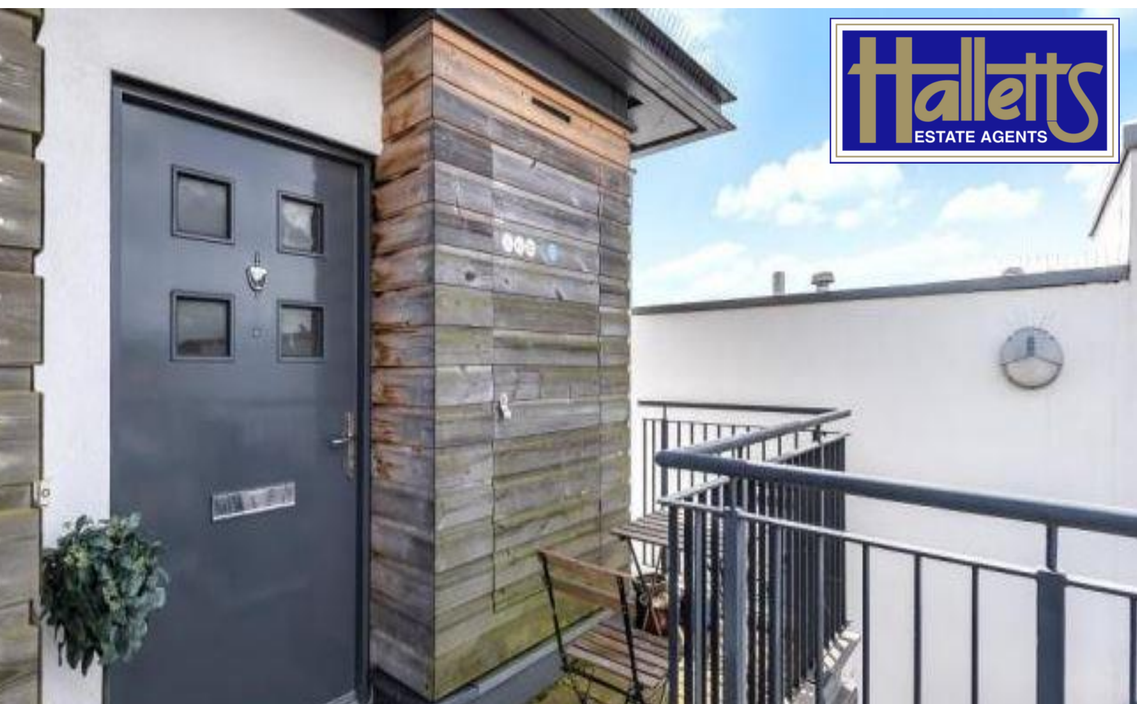
18 Melville Park Way Newbury Berkshire RG14 1DZ